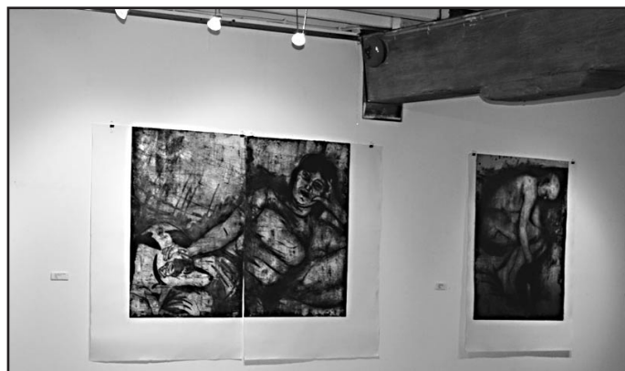
left: Any way the wind blows , 2008 Etching, right: On the couch , 2008 Etching.