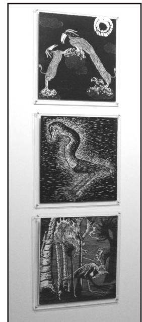
Three of the fantastic creature prints

HIP News deadline for January edition is December 12.